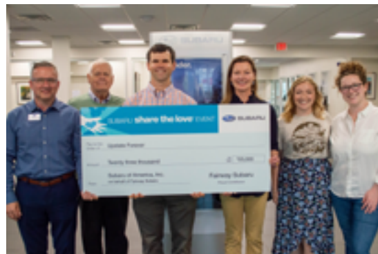
Many thanks to Fairway Subaru for supporting UF through its 2021 Subaru Share the Love event! We were blown away by the generosity of the folks at Fairway and customers who helped generate a gift of $23,000.