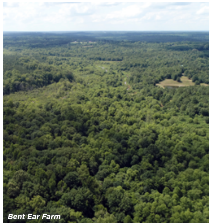
Bent Ear Farm