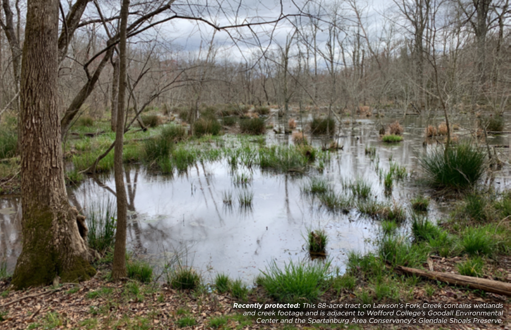
Recently protected: This 88-acre tract on Lawson's Fork Creek contains wetlands and creek footage and is adjacent to Wofford College's Goodall Environmental Center and the Spartanburg Area Conservancy's Glendale Shoals Preserve.