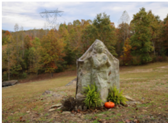
On the grounds of Soapstone Baptist Church, the sculpture "A Praying Woman Rising from the Rock," commemorates the matriarchs of the Liberia community, founded in 1865 by freed slaves. UF is honored to play a role in preserving this historic property forever.