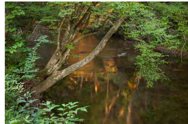
Funders and Partners: The Nature Conservancy, SCPRT, South Carolina Conservation Bank, and Open Space Institute

When The Nature Conservancy donated a 935-acre parcel to South Carolina Department of Parks, Recreation, and Tourism, and placed it under conservation easement with Upstate Forever, Jones Gap State Park became 25 percent bigger overnight. The park's expansion will result in new recreation opportunities and the protection of some of South Carolina's most rare and iconic species, including Rafinesque's big-eared bat, green salamander, black bear, and a newly discovered species of trillium.