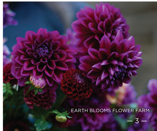
EARTH BLOOMS FLOWER FARM