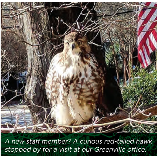
A new staff member? A curious red-tailed hawk stopped by for a visit at our Greenville office.