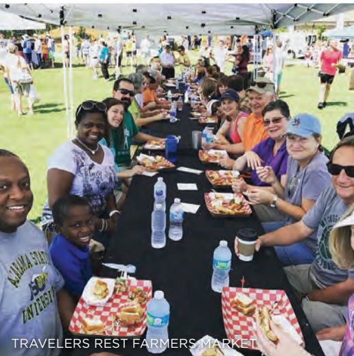
TRAVELERS REST FARMERS MARKET