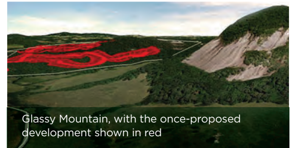
Glassy Mountain, with the once-proposed development shown in red

The tract of land near Glassy Mountain Heritage Trust Preserve in Pickens County that was once slated for a controversial real estate development has been permanently protected by a conservation easement. The proposed development, a subdivision of 254 homes on 183 acres to be called the Summit at Glassy, was the subject of local outcry since it was first made public. Upstate Forever was instrumental in working with the community and the owners of the proposed development site to realize a conservation outcome for this important tract of land near a Pickens County icon. Learn more at upstateforever.org/glassy