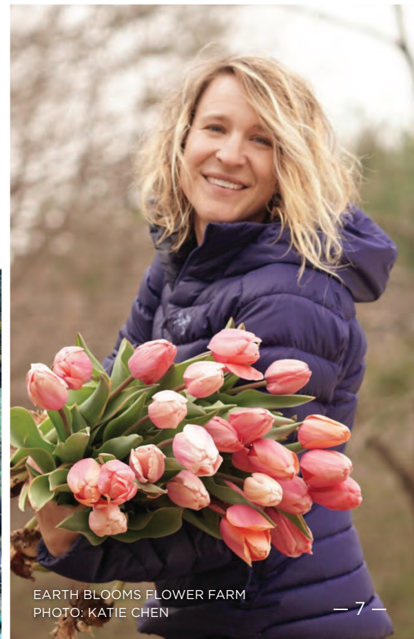
EARTH BLOOMS FLOWER FARM