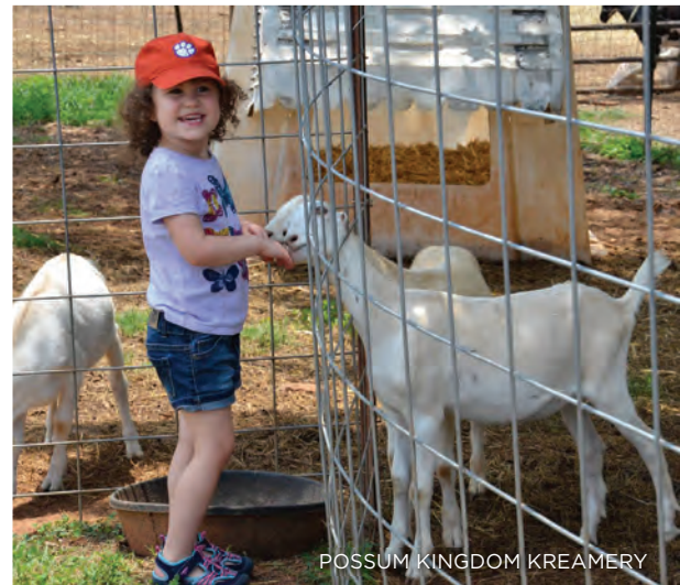
POSSUM KINGDOM KREAMERY