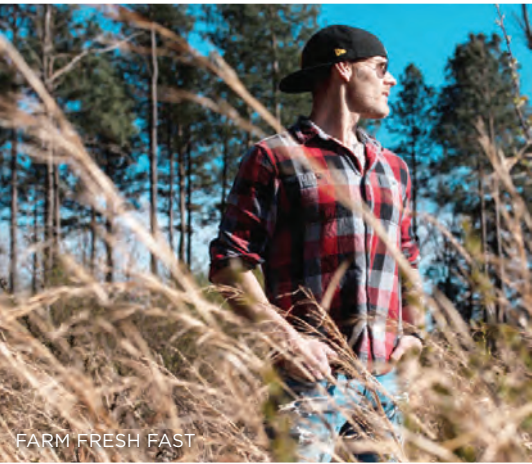
FARM FRESH FAST