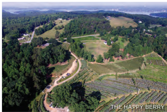
THE HAPPY BERRY