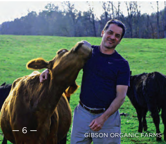
GIBSON ORGANIC FARMS