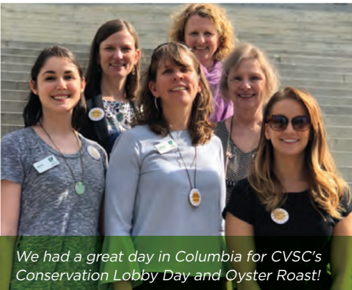
We had a great day in Columbia for CVSC's Conservation Lobby Day and Oyster Roast!