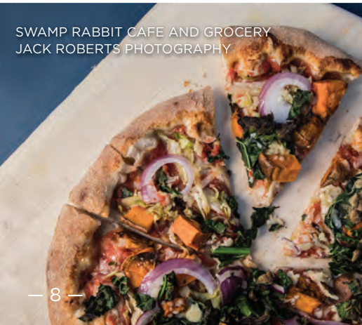
SWAMP RABBIT CAFE AND GROCERY