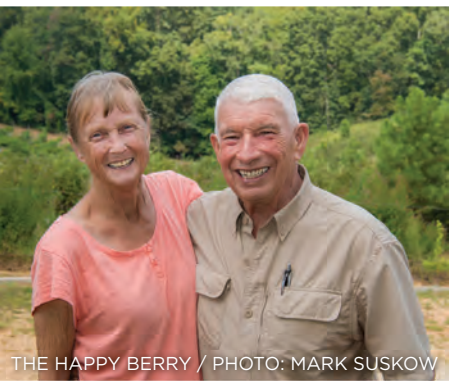
THE HAPPY BERRY

Upstate Forever's work preserving farmland helps prevent urban sprawl, boosts community health, and contributes to regional character.