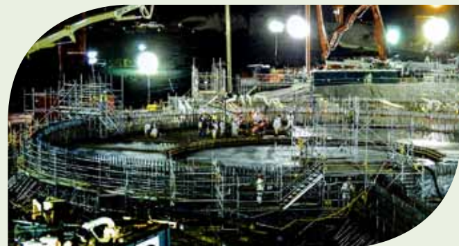
The V.C. Summer project.

Second, Duke Energy will need to make some decisions about future capacity in the Upstate soon, and it doesn't look like nuclear is a viable long-term option. They will almost certainly have to decommission the Oconee Nuclear Station around 2030, and they're abandoning its