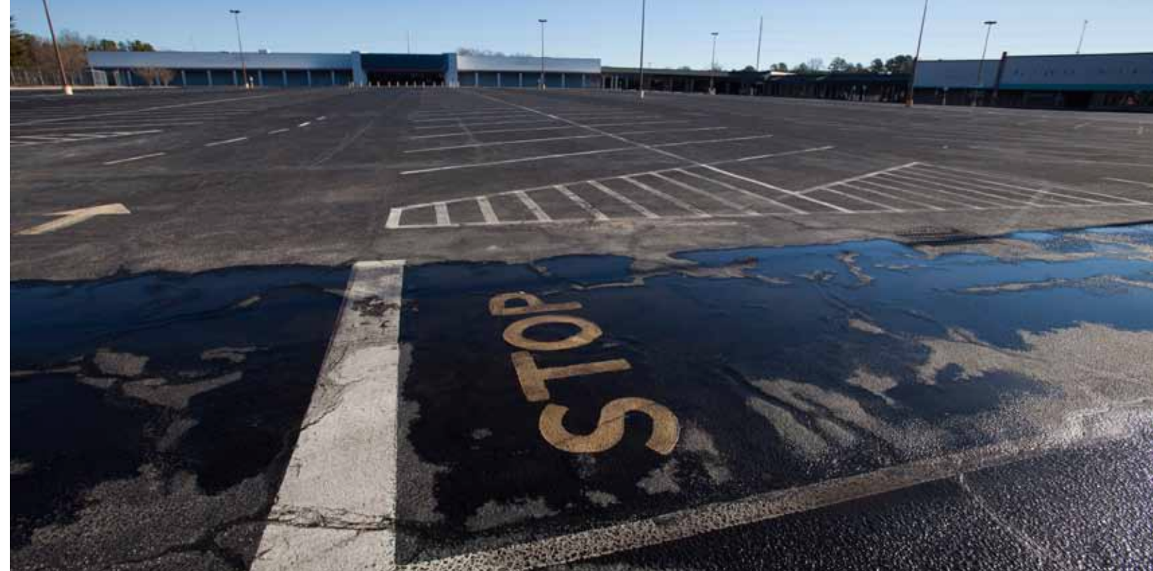
Sprawling development is extremely expensive to serve long term. The estimated revenues from our current pattern of development are less than half the projected costs to serve.

This pattern of development will be exorbitantly expensive >>