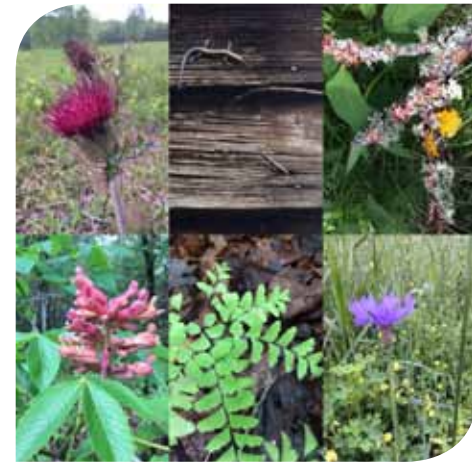
Found at the historic Hester Dairy farm by Upstate Forever staff, clockwise from top left: native thistle, five-lined skink, lichen and slime mold, bachelor button and yellow clover, maidenhair fern, and scarlet buckeye